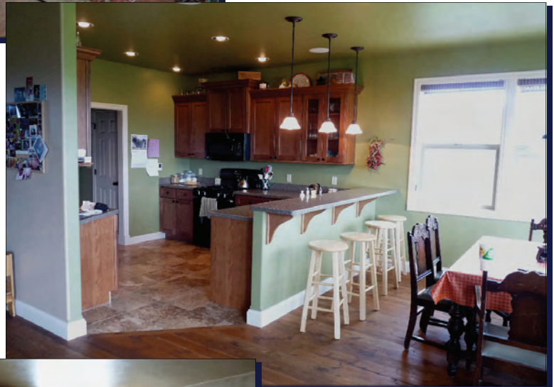
Kitchen is perfect for entertaining.