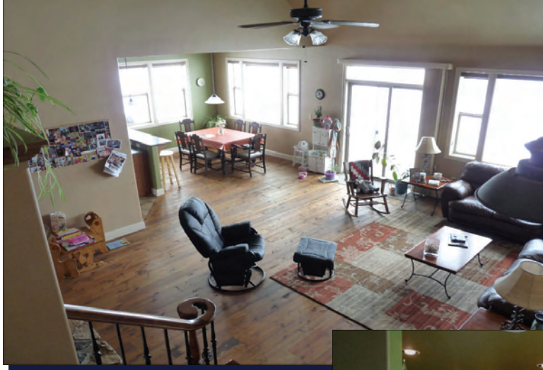
View of the great room from the staircase.