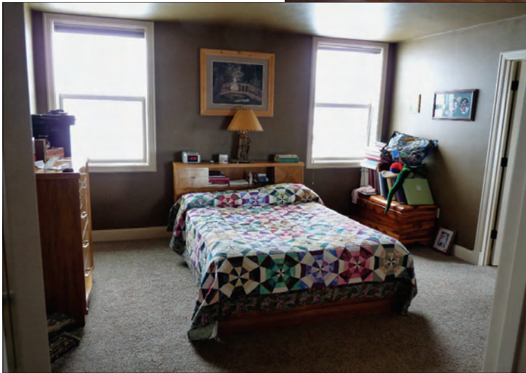
Master bedroom on the Main level.

Note: All information herein is from sources deemed reliable, but is not guaranteed by Seller, Clear Creek Realty, LLC or its Agents. This offering is subject to errors, omissions, prior sale, change or withdrawal without notice and approval of the purchase by the Owner. We urge independent verification of each and every item submitted to the satisfaction of any prospective purchaser.