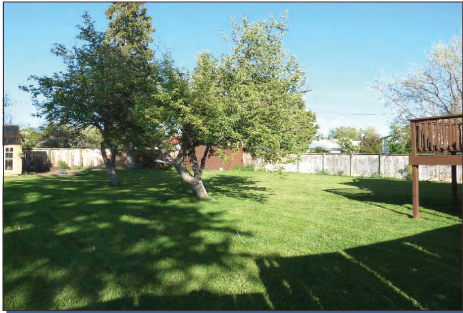
Back yard is large, fenced and has an upper deck overlooking it all.